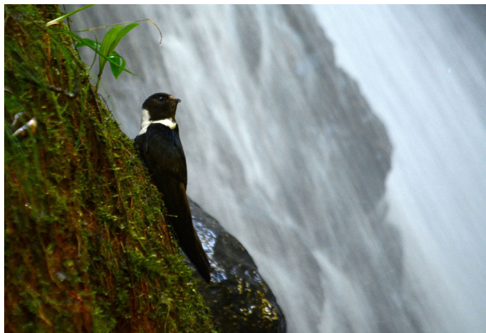
Fig. 3. One White-collared Swift clinging beside the waterfall after flying from the nest site.

depicted in Biancalana (2014), we concluded that both birds were adults. We suspect the swifts were prospecting for a nest site or possibly building or repairing their nest. This interpretation of the observation aligns more closely with the breeding phenology of White-collared Swifts described in other locations in the northern hemisphere, with clutch initiation reported to begin in mid-April (Rowley and Orr 1962, Turner 1981, Whitacre 1989, Chantler et al. 2016).