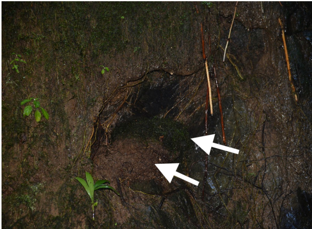
Fig. 5. White-collared Swift nest structure observed to the left of the waterfall. We observed at least one of the two individuals on the nest and in the recess. The white arrows indicate the mossy cluster (upper arrow) atop a raised platform of mud (lower arrow).