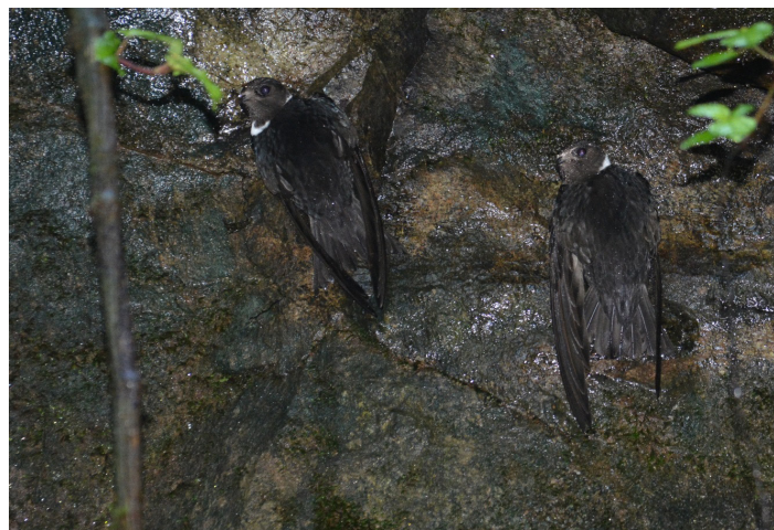
Fig. 4. The two White-collared Swifts clinging to the cliff adjacent to the waterfall. The nest is just outside the frame to the left.

We thank the following individuals for sharing their insights on the status of White-collared Swifts in Hispaniola: Steven Latta,