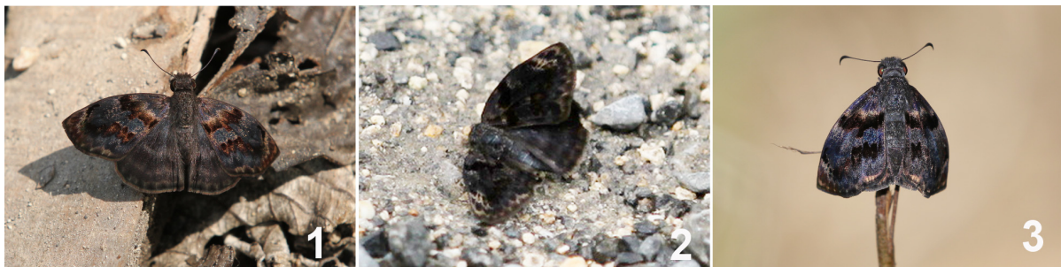
FIGURES 1–3. Adults of Chiomara gundlachi stat. rev. 1—Outskirts of Vallecito village, Pinar del Río, Cuba. 2—same data, road kill. 3—La Movida, outskirts of Santa Clara city, Villa Clara Cuba.

DNA extraction, PCR amplification, and sequencing of the COI barcode region were performed by the Canadian Centre for DNA Barcoding (CCDB). Polymerase chain reactions used the primer pair LepF1—ATTCAACCAATCATAAAGATATTGG and LepR1—TAAACTTCTGGATGTCCAAAAAATCA (Hebert et al. 2004) which recovers a 658 bp region near the 5' end of COI including the 648 bp barcode region for the animal kingdom (Hebert et al. 2003). Our two new sequences were submitted to GenBank: MK253654–55. COI barcode sequences of continental C. mithrax were downloaded from GenBank: JF777766, GU658613–14, GU658617–20, GU658246.. We examined adult specimens deposited at the Zoologische Staatssammlung München (ZSM), Munich, Germany and the Institute of Ecology and Systematics (CZACC) in Havana, Cuba. Genitalia dissections were made using standard techniques. Abdomens were soaked in hot 10% potassium hydroxide for one hour before dissection. The structures were then dehydrated in an alcoholic series and mounted on slides using Euparal.