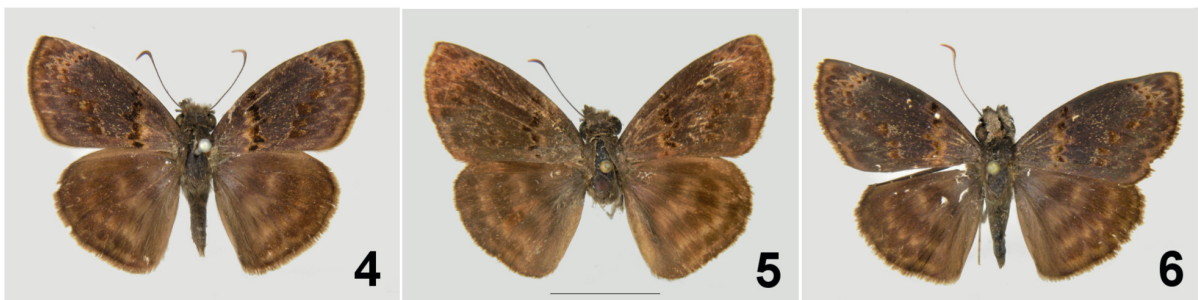
FIGURES 4–6. Adults of Chiomara mithrax . 4—Chiriqui, Panama. 5—Sinaloa, Mexico. 6—Rio Grande do Sul, Brazil. Scale bar 10 mm.