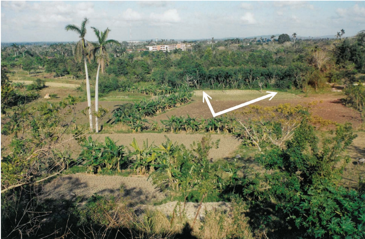
Fig. 2. General view of the habitat in the vicinity of Santa Clara, Cuba. The Carystoides was collected along the edge of the forest indicated by the arrows.

relative to species differences. For these reasons, species determinations in the genus are difficult and subject to interpretation.